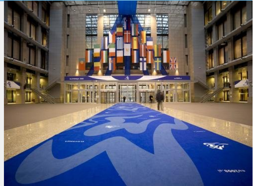
Inside the building for the Council of the European Union in Brussels where the code of conduct has been drafted.