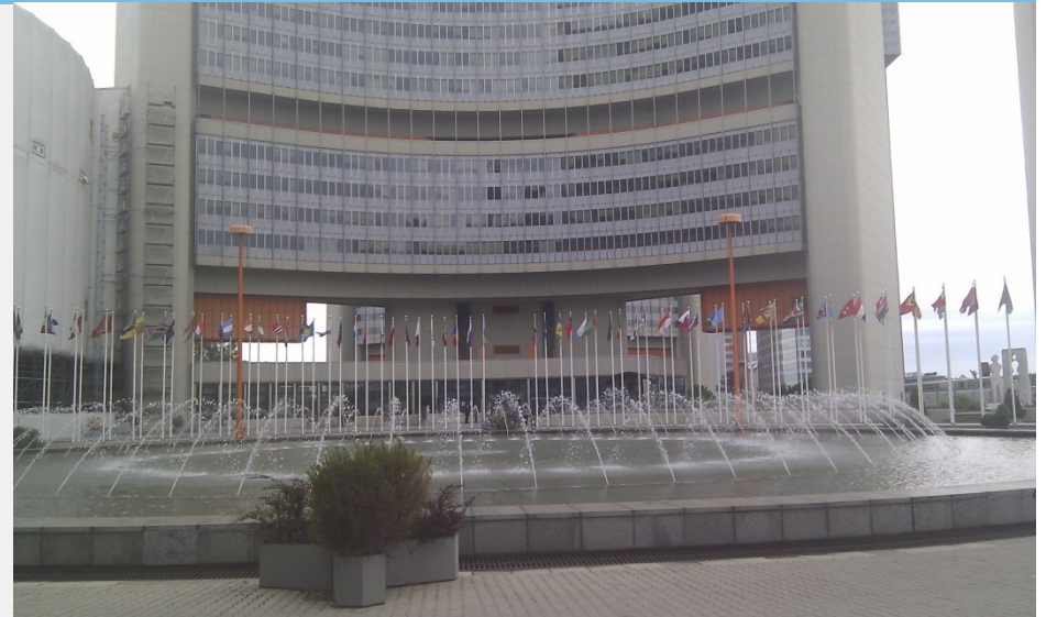
The United Nations Office at Vienna, home for the UN Office for Outer Space Affairs.